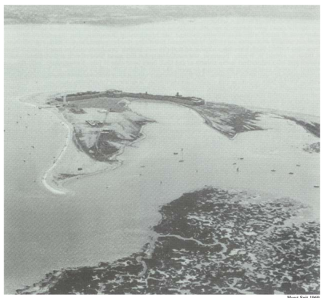
Hurst Spit 1969 Note the classic "Spit Hook" already forming at the entrance to the Lake