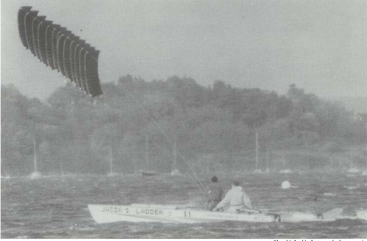
"Jacob's Ladder" at speed when securing the World Sail-Speed Record, Class C, 1982