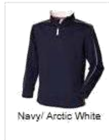
Navy/ Arctic White